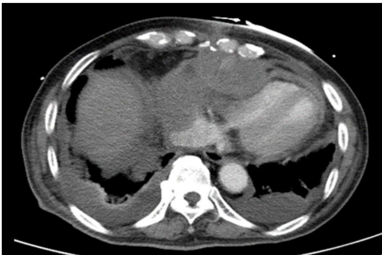
Fig. 2. Contrast-enhanced chest computed tomography image. A contrast-enhanced mass lesion was observed within the epicardial space, exhibiting a mass effect and causing compression of the right ventricle.

exploration for bleeding had an issue of anti-platelet agents used [6]. To the best of our knowledge, our case is the longest late surgical bleeding needed re-exploration, which was 5 weeks after CABG surgery. In the context of delayed bleeding, Tehrani et al. [7] presented a case of LIMA avulsion occurring four weeks after CABG surgery. In their case, the patient exhibited symptoms consistent with cardiac tamponade and cardiogenic shock [7]. In the context of preoperative antithrombotic strategy and its association with severe bleeding, adherence to current guidelines recommending the early discontinuation of P2Y12 receptor antagonists is crucial for reducing excessive bleeding and early mortality after CABG within the first 30 days [8]. When considering the use of aspirin post-CABG, a prospective study by Nouraei et al. [9] demonstrated that early administration of aspirin does not elevate the risk of post-operative bleeding following CABG. Pneumonia is the common complication of post-open heart surgery, which is related to multi-comorbidities, poor cardiac function, inadequate chest care and rehabilitation [10]. The patient presented with post-operative pneumonia and empyema, complicated with sepsis and poor nutrition status, which may affect the healing of sternal wound, leading to potential risk of bleeding. Furthermore, the nutritional status is a critical concern for patients undergoing CABG. Several studies