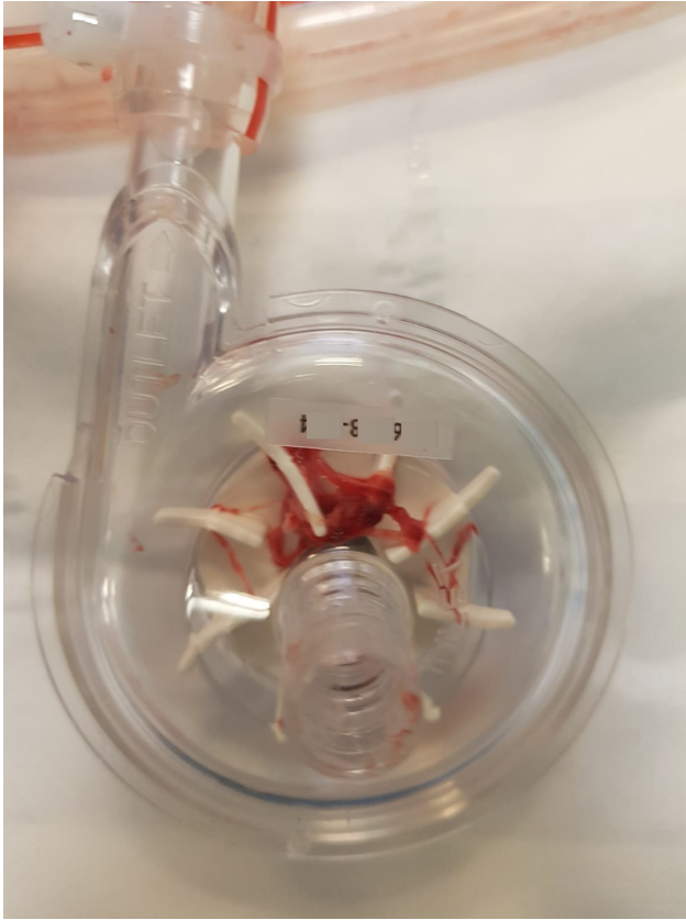
Fig. 3. Fibrin threads found on the device.

atric stroke and demonstrated that it is a very rare procedure (<1%), with a population of the patients tended to be older (>10 years). A review of mechanical thrombectomy in the general pediatric population published by Satti et al. [36] described a high recanalization rates and good clinical outcome, with the limitation of the study of small number of patients (n = 29). This population of children supported by the VAD system is a new population, and strict guidelines are still missing. Opposite, the aim is reducing the risk of stroke by better understanding and management of coagulation issues [29]. In patient 4, significant oscillations of coagulation parameters, mainly INR, was caused by dietary turmeric intake. Curcumin, a polyphenol responsible for the yellow color of turmeric, has anticoagulation properties [37].