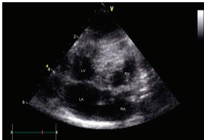
Figure 1. First postoperative images showing a large (20 × 22 mm) basal interventricular septal hematoma obstructing the left ventricle outflow tract. RA indicates right atrium; LA, left atrium; LV, left ventricle; RV, right ventricle; H, interventricular septal hematoma.

An interventricular septal hematoma is a very rare complication after VSD repair. A literature review in the PubMed database revealed only 5 case reports (6 patients) concerning this kind of complication [Drago 2005; Bernasconi 2007; Jensen 2007; Padalino 2007; Zhuang 2008]. In the non-pediatric population, an interventricular septal hematoma has been described after myocardial infarction, chest trauma,