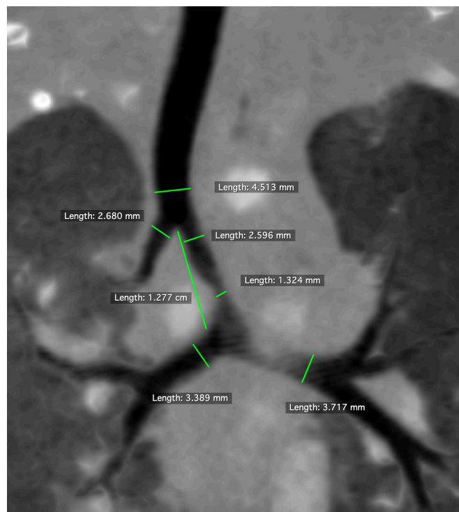
Figure 1. Axial view of computed tomography demonstrated the stenosis of trachea by specific value.

PAS is associated with other cardiovascular abnormalities [Fiore 2005] like patent ductus arteriosus (PDA), atrial septal defect (ASD), ventricular septal defect (VSD), and double aortic arch (DAA). Combining with other anomalies may lead to special change of hemodynamics, which has vital influence to clinical manifestation and surgical decision of PAS patients. To our knowledge, few case reports described patients with PAS in addition to a large VSD who underwent LPA reimplantation without tracheoplasty [Matsumoto 2019]. This case report describes possible thoughts and methods of treatment for these kinds of patients.