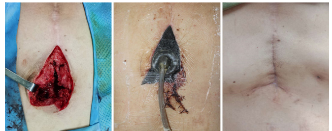
Figure 2. The importance of debridement and negative pressure therapy.

DSWI is widely accepted as a high-risk postoperative complication of cardiac transplantation that may lead to septic shock or vessel rupture with massive hemorrhage from suture-line damage of the heart. Additionally, immunosuppressants applied postoperatively may promote the spread of infection, which leads to more serious complications [Bhatt 2020]. Thus, early diagnosis with appropriate therapy for DSWI plays an important role in management of infection and prevention of further complications after cardiac surgery.