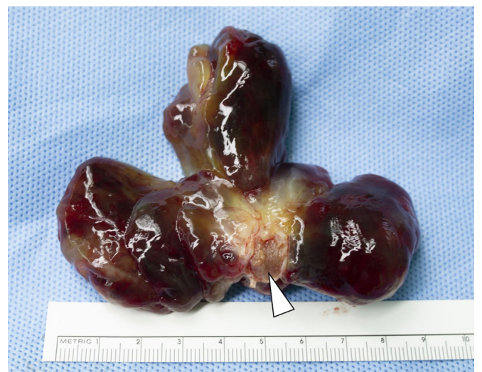
Figure 3. The resected tumor attaching right ventricular outflow tract with short stalk (white arrow).

The present case satisfied the diagnostic criteria of PE, according to the guideline, and had no indication for invasive therapy [Konstantinides 2020]. Although the RV tumor was always under consideration, its rarity made the way to true diagnosis more difficult. The mortality of patients awaiting surgery, following definitive diagnosis, has been reported as 8% in left atrial myxoma [Symbas 1976]. Even though no data has been shown about right-side myxoma, it can cause syncope, dysrhythmia, pulmonary emboli, valvular dysfunction, and sudden death, depending on its position and size [Katiyar 2020; Rao 2016].