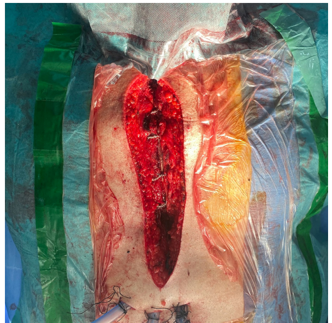
Figure 3. Interlocking multi-twisted wire closure. Opposite twisted ends are twisted together.

Study protocol: Preoperative preparation involved patients having an antiseptic shower with diluted povidone-iodine and excessive hair in the chest wall removed the day