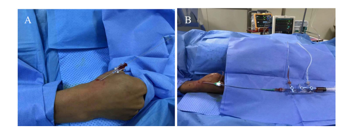
Figure 2. Percutaneous coronary angiography via dTRA. A, success of puncture; B, insertion of sheath and catheter.

criteria were women weighing less than 50kg, and patients who wanted to receive PCI at the same time if the lesions were found after coronary angiography. All patients were divided into the dTRA group and cTRA group, and each group had 40 patients. Patients in the dTRA group underwent distal transradial access, and patients in cTRA group underwent conventional transradial access.