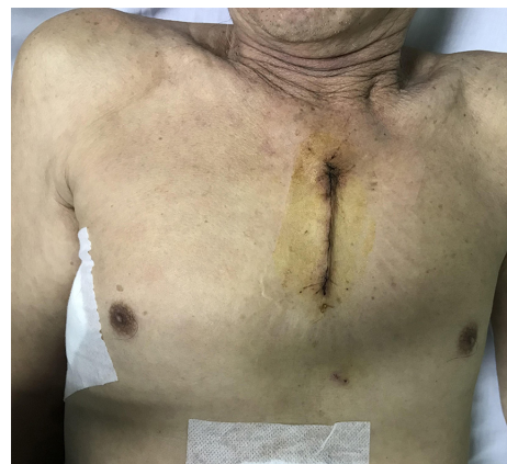
Figure 1. Skin incision.

Recently, the frozen elephant trunk technique has been applied to reinforce the distal anastomosis and enhance false lumen (FL) thrombosis. With this novel technique, the FL thrombosis rate is significantly higher compared with conventional elephant trunk and hemiarch or total arch replacement [Uchida 2009; Di Bartolomeo 2017]. However, frozen elephant trunk prostheses are not always available, particularly in Third World countries. Hence, finding another option to solve this problem is important to provide better care for our patients. Descending aorta stent grafting, antegrade fashion in an open