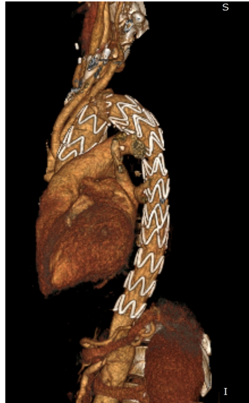
Figure 3. Follow-up CT scan 1 year after surgery.

An L-shaped upper ministernotomy was performed in the usual manner (Figure 1). The fatty tissue of the thymus was completely removed to provide good exposure of the arch branches. The innominate vein was exposed and retracted using fabric tape. The brachiocephalic trunk, the left common carotid artery, and the left subclavian artery were successively