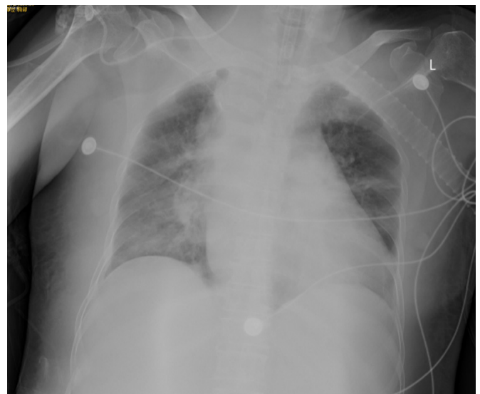
Figure 5. Day 7 of ECMO: chest X-ray after removal of ECMO.

Laboratory blood tests indicated low platelets and impaired liver and kidney function. She was diagnosed with scrub typhus and acute pneumonia.