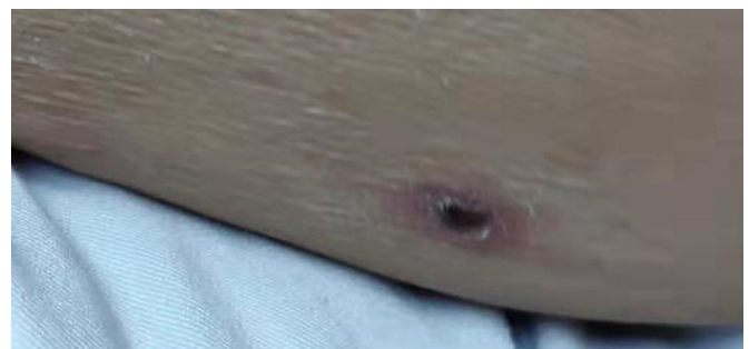
Figure 1. Patient's right shoulder eschar.

Admission examination showed body temperature 36.8°C, heart rate 98 beats/min, respiratory rate 26 breaths/min, blood pressure 95/53 mmHg, and blood oxygen saturation 96%. Ambiguous findings were Glasgow Coma Scale 12 points; Acute Physiology and Chronic Health Evaluation II 16 points; and dilated pupils, diameter 3 mm and sensitive to light, with mild yellow staining of the sclera. A 1.5 × 1.5-cm eschar was visible on the right shoulder (Figure 1). Chest x-ray examination showed lung exudation (Figure 2).