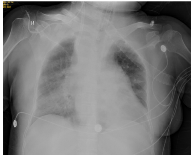
Figure 4. Chest x-ray on day 3 after ECMO assistance.