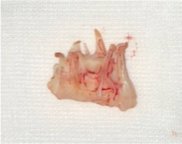
Figure 2. Excised mitral valve.

In this paper, we present a successful mitral valve replacement and thymectomy in a patient with ocular MG, using normothermic cardiopulmonary bypass (CPB).