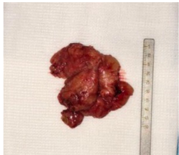
Figure 1. Excised thymus.

While still debated, thymectomy is a feasible and effective treatment, both in thymomatous and nonthymomatous MG cases [Aydin 2017]. Careful intraoperative and postoperative management, with general anaesthesia and appropriate use of NMBAs, as well as meticulous assessment of the patient's neurologic and cardiac status are needed in order to avoid life-threatening complications [Blichfeldt-Lauridsen 2012; Ishimura 1998].