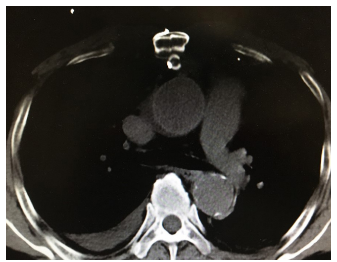
Figure 3. CT showing reveals the aortic wall annular calcification.

Baseline data: The patient average age was 48.5 \pm 13.9 years (29-76 years), the male percentage was 46.7% (7/15).