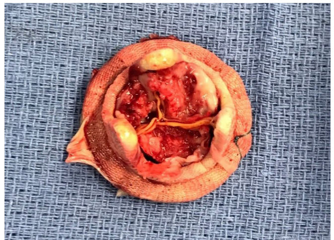
Figure 3. Explanted bioprosthetic mitral valve: thrombotic masses are evident on the ventricular aspect of all three valve leaflets, essentially occluding the valve orifice.

Bioprosthetic valve thrombosis is more common than has been previously recognized. Acute valve thrombosis is potentially life-threatening and warrants emergent intervention, be it