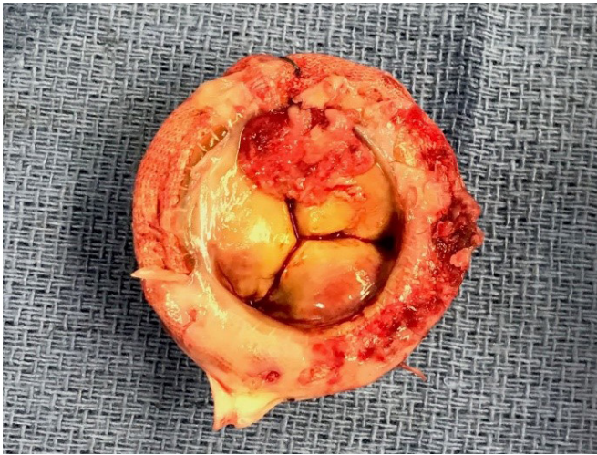
Figure 2. Explanted bioprosthetic mitral valve: a large thrombotic mass is evident crossing the atrial aspect of two of the valve leaflets.

veno-arterial extracorporeal membrane oxygenation (ECMO) was instituted via a femoral approach.