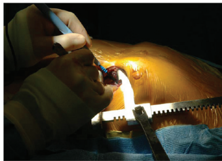
Distal anastomoses via small thoracotomy