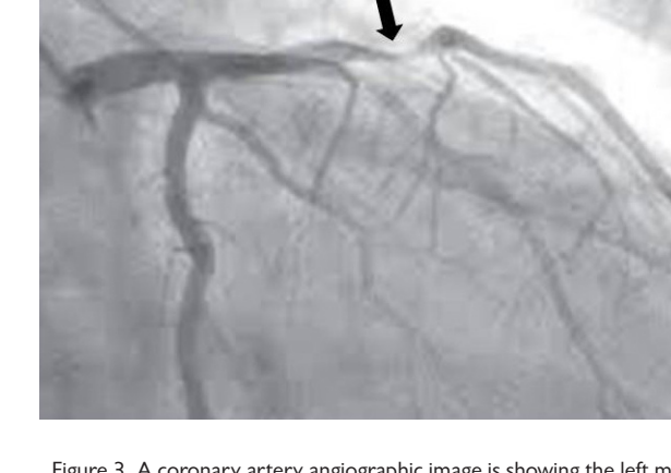
Figure 3. A coronary artery angiographic image is showing the left main coronary artery and its branches such as the left anterior descending and circumflex artery prior to percutanous coronary artery intervention. Black arrow indicates the severe occlusion of the left anterior descending artery with the circumflex branch of the left main stem.

The complications such as myocardial ischemia, stroke, renal insufficiency, and pulmonary complications did not occur after the operations or PCI. In one patient from the CABG group, the duration of intubation and ICU stay was prolonged because of respiratory failure. The mean duration of associated procedures was 298.9 \pm 33.9 minutes in this