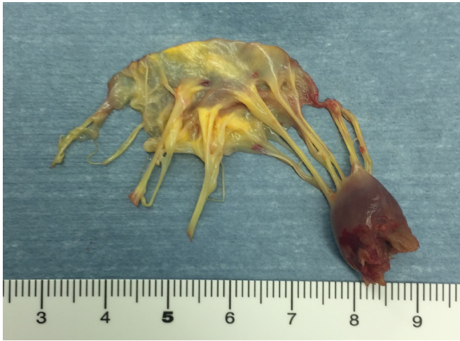
Figure 2. The anterior papillary muscle was completely ruptured at baseline. The papillary muscle showed necrotic degeneration, but the chordae tendinae and mitral leaflet were relatively normal.

circumflex coronary artery was normal. The blood supply was not evaluated in the present case; however, the fact that there was myocardial infarction just below the first diagonal artery on CT may indicate that the blood supply of the infarct area was dominated by the first diagonal branch. The other issue may be that precise diagnosis of blood supply to the papillary muscle has not been clinically established.