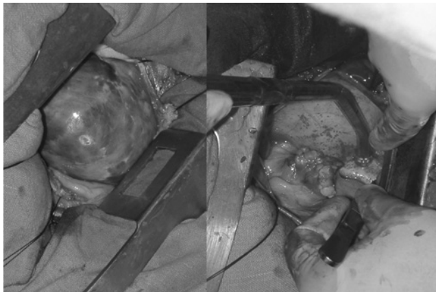
Figure 2. Left atrium appendage aneurysm before and after excision.