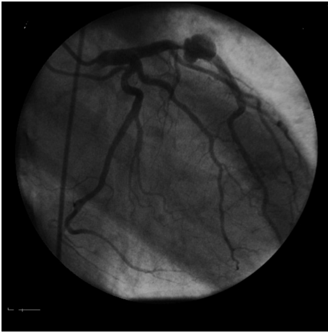
Figure 1. Before surgery, cardiac catheterization revealed a 90% lesion of the left anterior descending artery after the first septal perforator with a sacular aneurysmal dilatation.