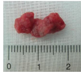
Figure 3. The irregular friable light-pink tumorous mass resected from the right ventricle cavity.

The procedure was performed via midline sternotomy with extracorporeal circulation (ECC) and mild hypothermia. After classic midline sternotomy and gentle preparation for ECC cannulation, preoperative heparin was administered in regular dose (3 mg/kg/bw), cardiopulmonary bypass was started, and mild hypothermia was reached. At the 32^{\circ}\text{C} central temperature both caval snares were tightened; after aortic cross-clamp and cardioplegic arrest the heart was opened. The RV cavity was reached through the right atrial (RA) approach, the atrial septal defect foramen ovale type (FoA) was primary sutured. The tumorous mass was exposed in the subvalvular TV apparatus, within the papillary muscle and chordae of the septal and partially posterior leaflets. Its macroscopic image resembled thrombotic material. The irregular friable light-pink tumorous mass attached to the chordae tendineae was gently prepared and evacuated from the RV cavity, without the need to excise the TV apparatus (Figure 3). The great care to preserve TV function was checked during intraoperative control. The heart was closed, aortic cross-clamp released, and after the patient's rewarming, the ECC was finished with sinus rhythm. Heparin reversion, routine hemostasis, pacing wires, pericardial drainage, and chest closure were performed. Control TEE showed normal contractility and good TV competence with