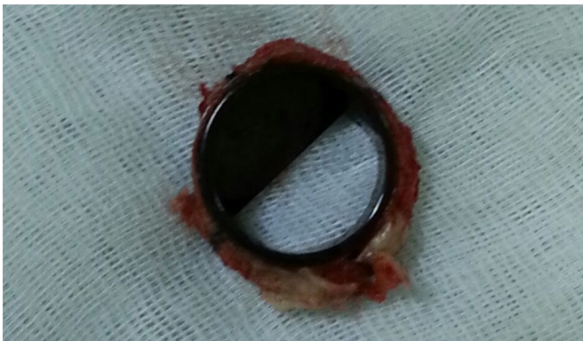
Figure 2. Sorin bicarbon prosthetic mitral valve removed by emergency surgery.

pH of 7.215 with an oxygen mask of 10 L. On pulmonary auscultation, there were rales, which were widespread in all lung fields. The valve click was absent and a systolic murmur near the heart's apex could be noticed on cardiac auscultation. Chest x-ray revealed acute pulmonary edema with aggravated cardiomegaly. The electrocardiography showed sinus tachycardia and atrial extrasistolls. Bedside TTE was performed