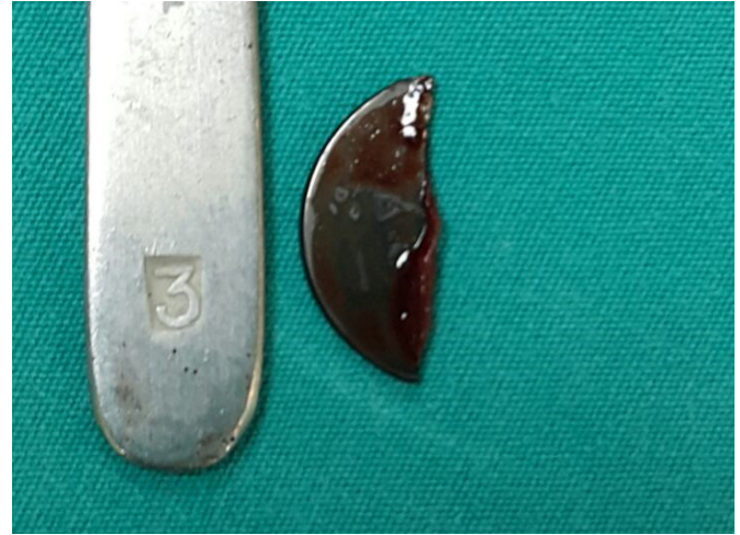
Figure 6. Missing leaflet.

There was no thrombosis, sign of endocarditis, or pannus formation. The prosthetic valve was excised and removed (Figure 2). A 29 mm St. Jude mechanical bileaflet mitral valve was inserted. The missing leaflet could not be found within the cardiac cavity. The abdominal fluoroscopic study and plain radiography were unable to detect the escaped leaflet at the end of the operation. CPB was discontinued and dopamine/dobutamine administered. The patient was weaned from CPB and could be referred to the ICU in stable condition. Hemorrhagic complications weren't identified. Postoperatively, the patient awoke on day 3, and showed no sign of neurological abnormality and did not need respiratory