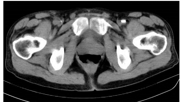
Figure 3. Computed tomography scan showing the location of the escaped leaflet in the left femoral artery.

pH of 7.215 with an oxygen mask of 10 L. On pulmonary auscultation, there were rales, which were widespread in all lung fields. The valve click was absent and a systolic murmur near the heart's apex could be noticed on cardiac auscultation. Chest x-ray revealed acute pulmonary edema with aggravated cardiomegaly. The electrocardiography showed sinus tachycardia and atrial extrasistolls. Bedside TTE was performed